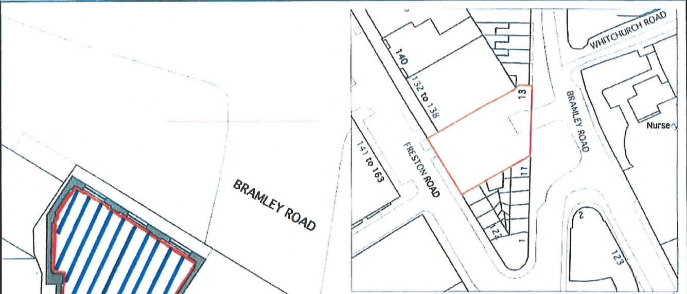
LOCATION PLAN SCALE: 1250